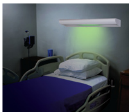
LED night light