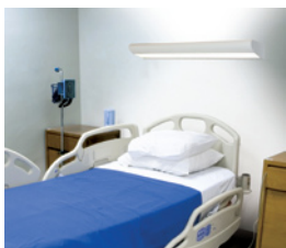
Uplight & Downlight